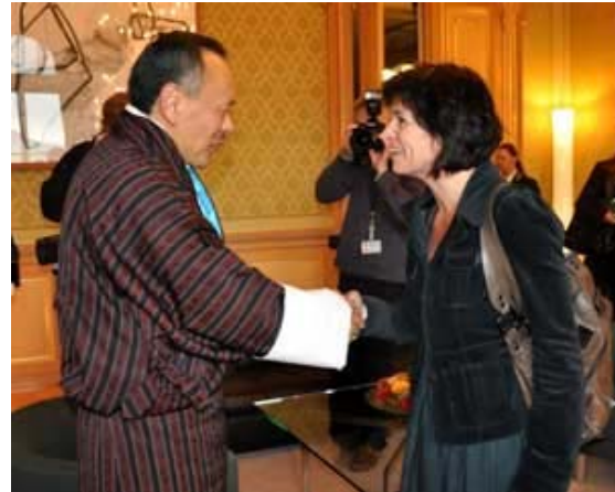
Lyonchhoen Jigmi Y Thinley with President Doris Leuthard of the Swiss confederation

Expresses his hope that longstanding relationship continues