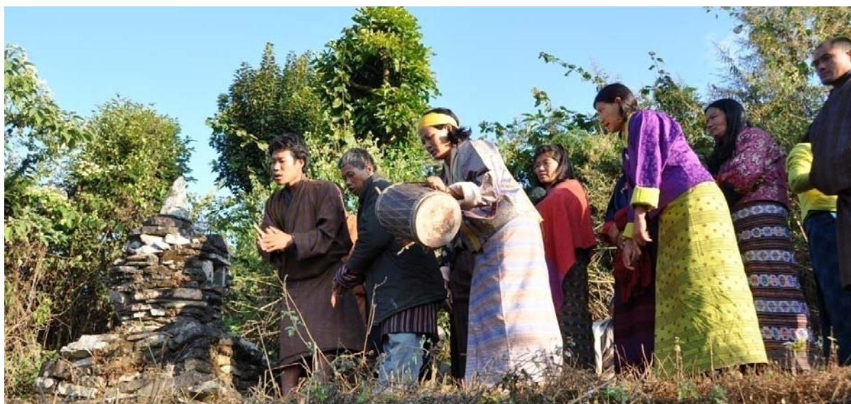
Women and men bid farewell to the local deity at the end of the three day local Choepda celebration in Ngalatrong in Zhemgang.

management modalities. Potential projects sites have been visited and four sites identified – the Rai and Lhop communities in Samtse (both in Dorokha gewog), Kheng community under Ngala gewog in Zhemgang, and the Shar chop community under Kengkhar gewog in Mongar. Documentation of culture, traditions, agriculture and foodways as well as ethnobotanic knowledge of the project sites have begun. Audio visual documentation of the local festivals in the Lhop and Kheng communities has been carried out. To have continued local presence, a community coordinator in the Lhop community has been appointed