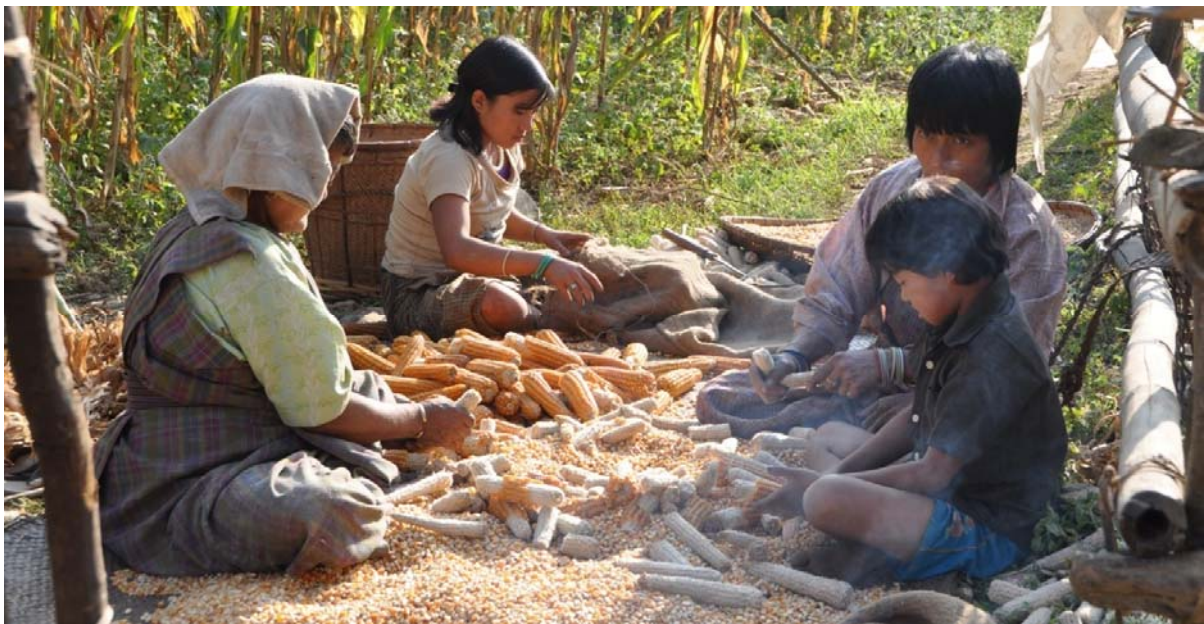
A family in Zhemgang with bumper maize harvest :

the ongoing construction of 15 kilometer farm road directly benefiting 650 households (approx. 8000 persons). Other activities included dairy, poultry and beekeeping based income generating activities, introduction of drip irrigation and formation of self-help groups (especially for credit and saving). An external review was completed to assess progress and make strategic recommendations for the remainder of the phase. It mainly recommended the need to strengthen bottom-up planning and implementation, focus resources on households below the national poverty line, and to strengthen the economic viability aspects of the various income generating activities.