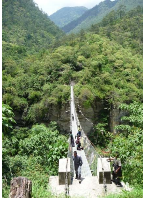
Working jointly by male & female for the maintenance of bridge over Kuri chu under Mongar Dzongkhag :

SDC and Helvetas engagement in this programme started in 1985. Priority during the last phase was given to capacity development of district engineers to prepare them for taking on more functions being decentralized to districts. There are visible improvements in the regular maintenance of the bridges by caretakers appointed. In the last phase, 8 new bridges were completed, and 43 rehabilitated (steel decking).